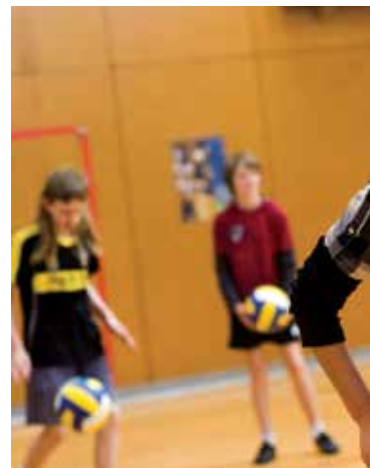
skills, interests, strengths,