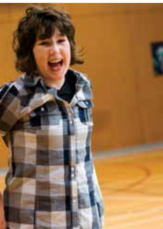
dreams and aspirations